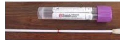
Eswab — Purple Cap

All Hologic Cyto-Molecular tests are listed in the documents located on ACL's website ( https://www.acllaboratories.com/providers/specimen-handling ).