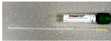
Eswab — Green Cap