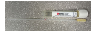
Eswab — White Cap