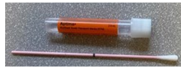
Aptima MTS Tube