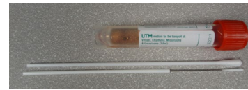
Universal Transport Media (UTM)