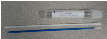
Aptima Unisex Swab